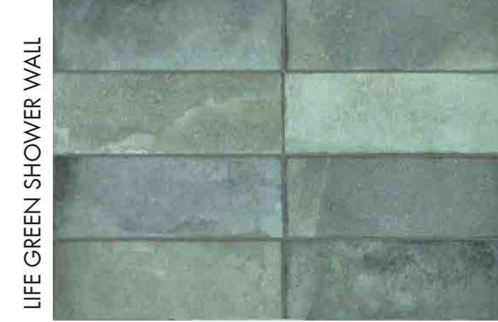
LIFE GREEN SHOWER WALL